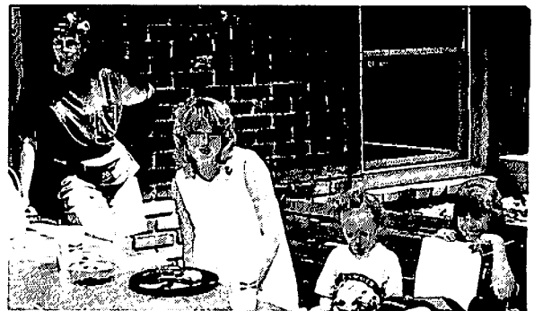
The Karst family sale in Kansas

To everyone who took the opportunity to make Ichthyosis Awareness Week the success it was- CONGRATULATIONS- let's keep up the good work!!