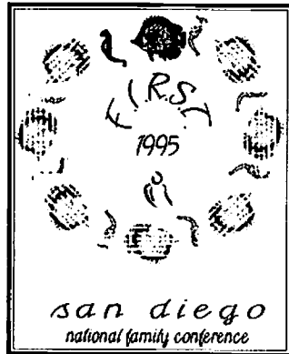
1995 National Conference T-Shirt